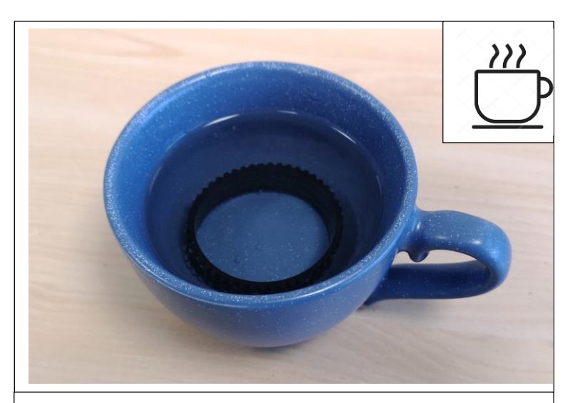
Put replacement braking lining in hot water (80°c) for 10 min