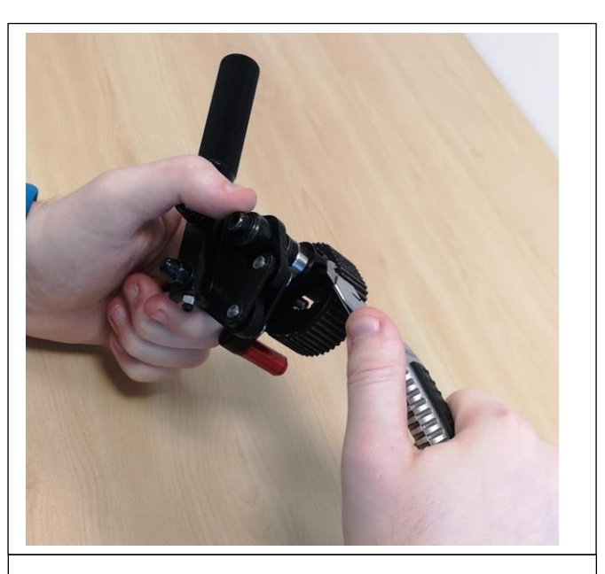
When cutting, please cut away from you