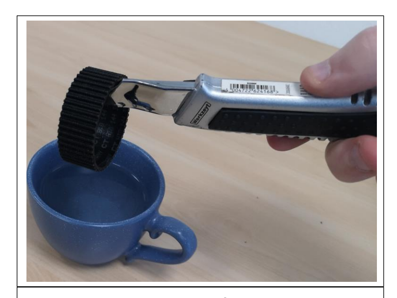
Take brake lining out of hot water with tools