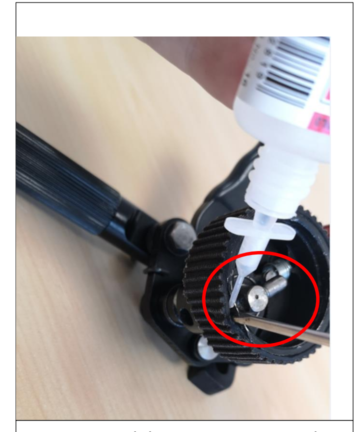
Not required, but we recommend that the brake lining be glued to the brake wheel at the bottom on a flat part (1 drop)