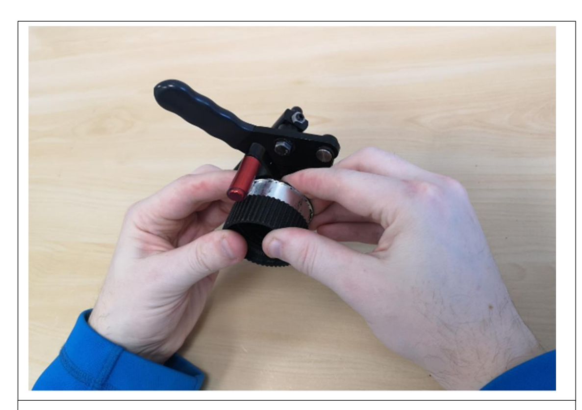
Align warm brake lining with the brake wheel and push hard. Installation is easier with a heated brake lining.

Brake lining MUST be pushed till end of braking wheel. Situation as on picture is NOT OK!