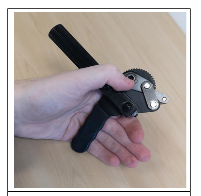
To be safe at cutting please hold brake as on the picture